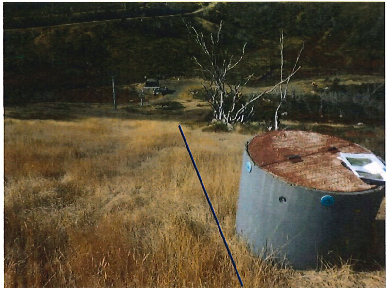
Figure 5: Existing snowmaking main and hydrant pit