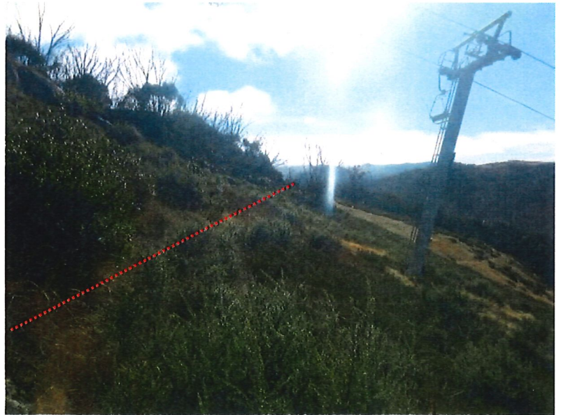
Figure 1: Snowmaking main to service hydrant F1 (looking north)