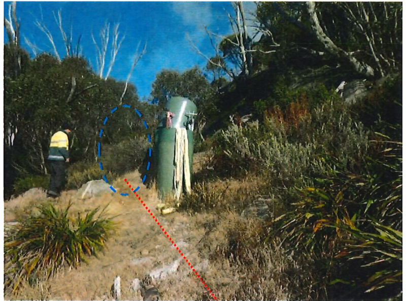
Figure 2: Hydrant F1 location