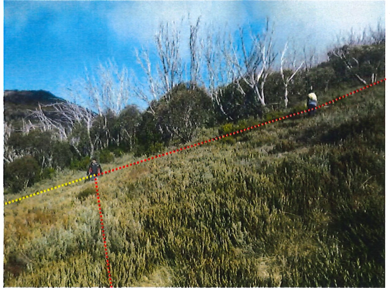
Figure 7: Snowmaking main and lateral to service hydrants F2-F4 (looking south)