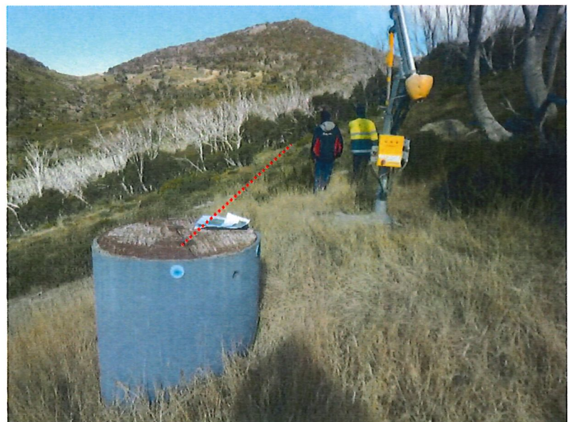
Figure 6: Snowmaking main to service hydrants F2-F4 (looking south)