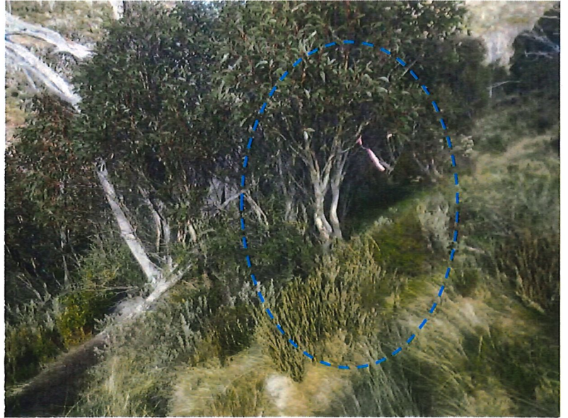
Figure 10: Hydrant F2 location