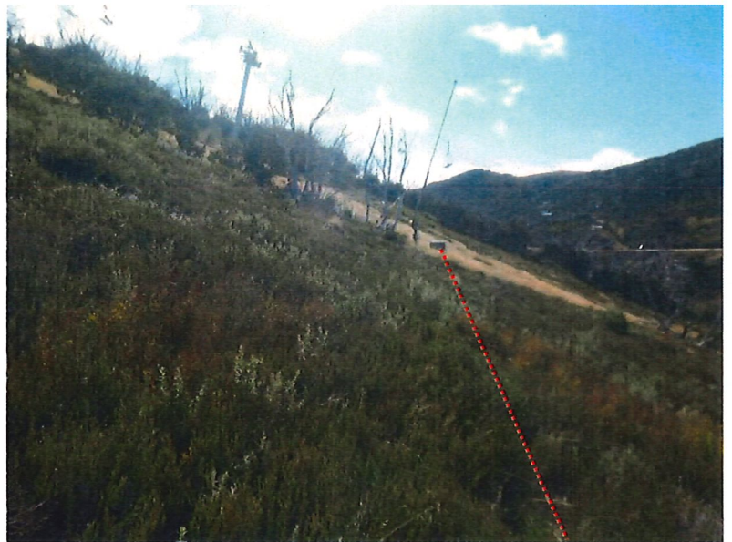
Figure 8: Snowmaking main to service hydrants F2- F4 (looking north)