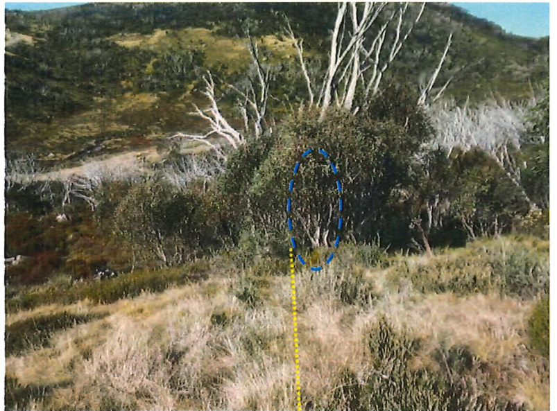
Figure 11: Hydrant F4 location