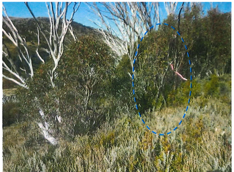
Figure 9: Hydrant F3 location